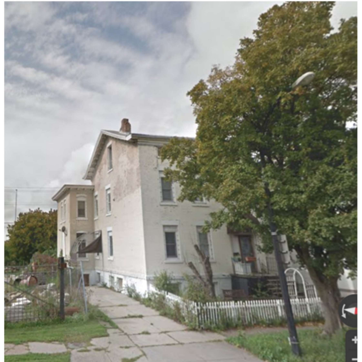
Samuel Wilson Home, 1966 Niagara Street