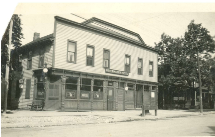
Heitzmann Hotel, 206 Dearborn Street, c. 1910