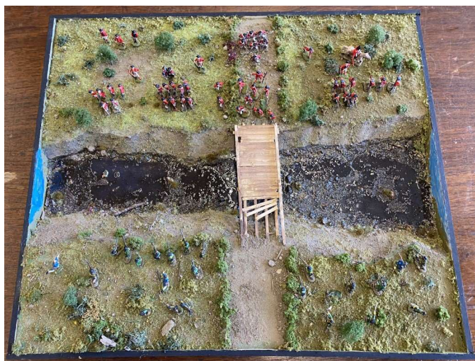
Battle of Scajaquada Creek Bridge