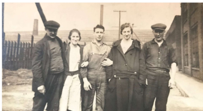
U.S. Hame Co. Workers