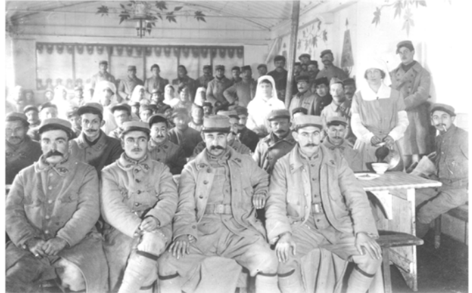
Le Cantine des Deux Drapeaux