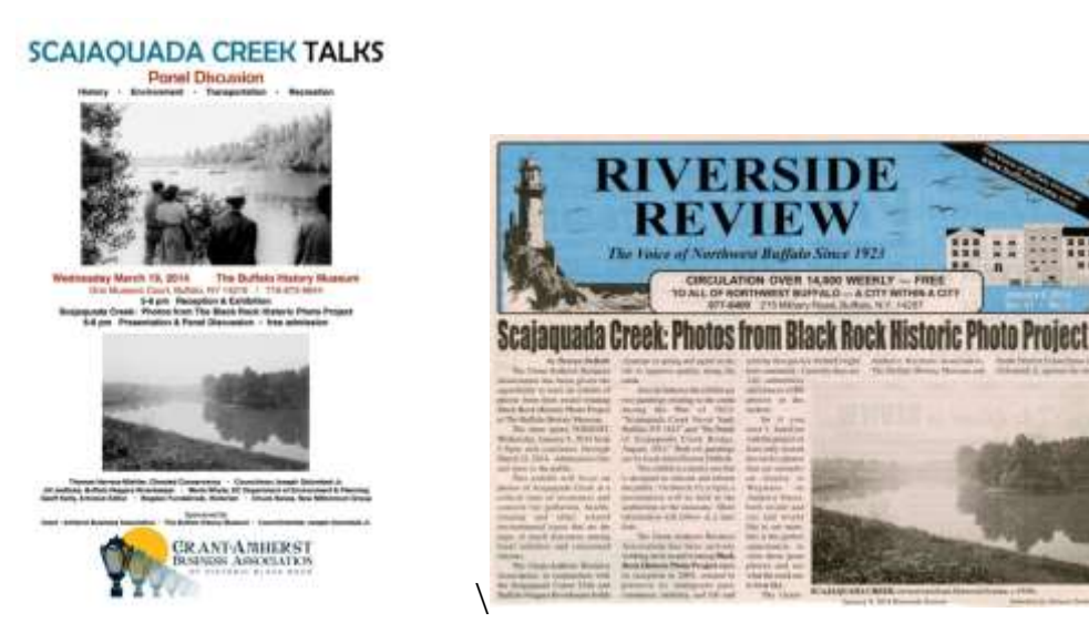
Photo exhibit and panel discussion at History Museum- Jan. 8, 2014.